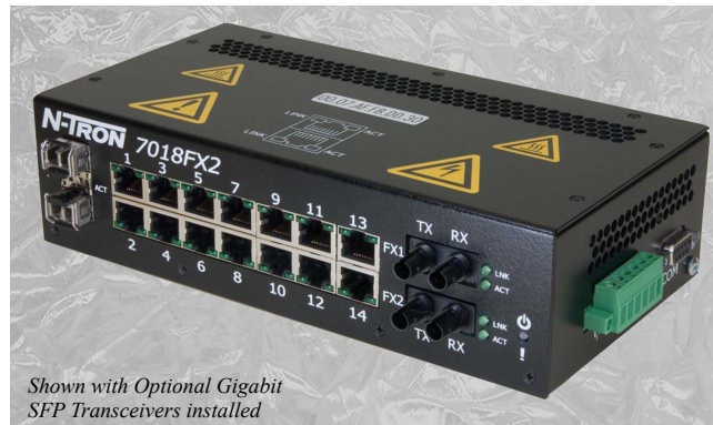
Shown with Optional Gigabit SFP Transceivers installed

DHCP -DHCP Server/Client automates the assignment of IP addresses. DHCP Option 82 assures that if a device on a specific port is replaced, the replacement receives the same IP address as the original device.