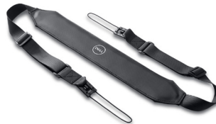
Shoulder Strap - SWT-SHSTP

Reversible, removable handle with angled design makes it easy to reach the controls in the tablet's configurable bay.