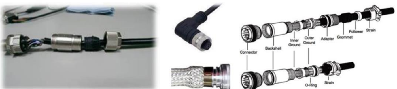
Figure : EMI Shielding Cable Kit

Electromagnetic Interference (EMI) is prevalent throughout the anywhere. The main purpose of effective EMC Shielding is to prevent electromagnetic interference (EMI) or radio frequency interference (RFI) from impacting sensitive electronics. This is achieved by using a metallic screen to absorb the electromagnetic interference that is being transmitted through the air. The shield effect is based on a principle used in a Faraday cage – the metallic screen completely surrounds either the sensitive electronics or the transmitting electronics. The screen absorbs the transmitted signals, and causes a current within the body of the screen. This current is absorbed by a ground connection, or a virtual ground plane. By absorbing these transmitted signals before they reach the sensitive circuitry, the protected signal is kept clean of electromagnetic interference, maximizing shielding effectiveness.