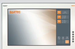
POLARIS Remote ZeroClient 12.1" W