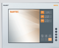
POLARIS Remote ZeroClient 15"