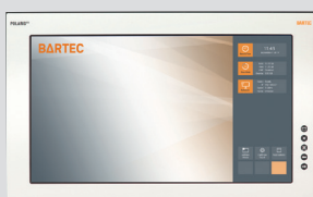
POLARIS Remote ZeroClient 17.3" W