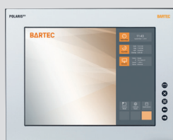
POLARIS Remote ZeroClient 15" Sunlight