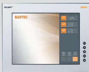
POLARIS Remote ZeroClient 19.1"