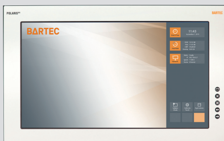
POLARIS Remote ZeroClient 24" W