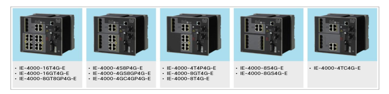
Figure 1. IE 4000 Models

Figure 1 shows switch models, Table 2 shows all the available Cisco IE 4000 Series models, Table 3 lists the SW license PIDs, and Table 4 lists the power supplies for Cisco IE 4000 Series Switches.