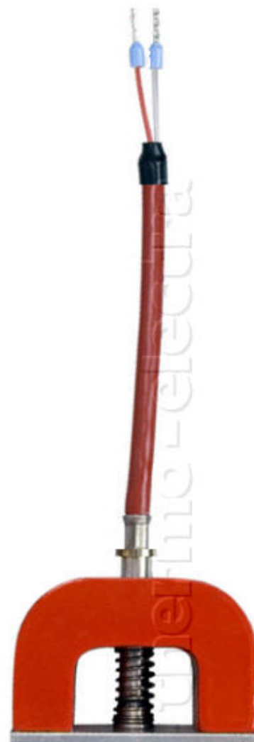
Tolerances for 100 Ω thermometers