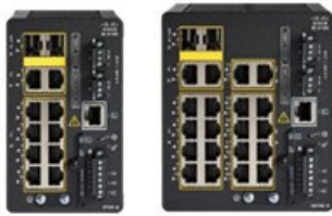
Figure 2. IE-3105 Rugged Series switch models with enhanced feature set