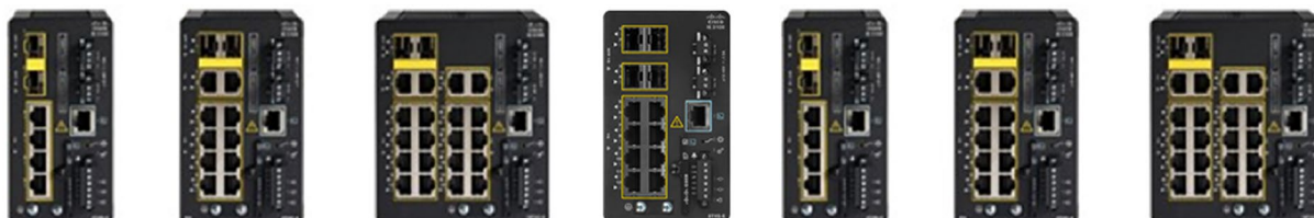
Figure 1. IE-3100 Rugged Series switches models