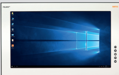
POLARIS Professional 24" W