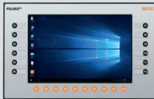
POLARIS Professional 12.1" W