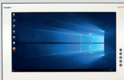
POLARIS Professional 17.3" W