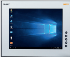
POLARIS Professional 15" Sunlight