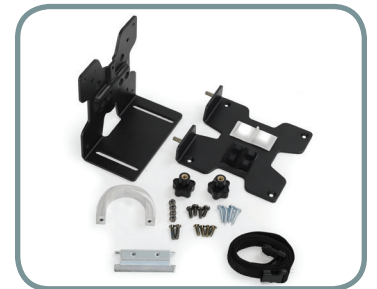
INCLUDED MOUNTING PADS AND STRAP INCREASE STABILITY

Download additional resources at ergotron.com .