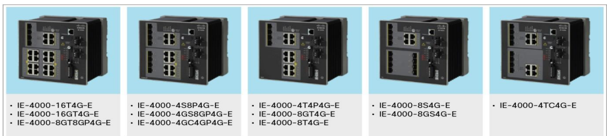
Figure 1. IE 4000 Models

Figure 1 shows switch models, Table 2 shows all the available Cisco IE 4000 Series models, Table 3 lists the SW license PIDs, and Table 4 lists the power supplies for Cisco IE 4000 Series Switches.