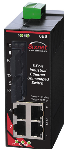
SL-6ES-4/5 Lexan Case Standard Temperature