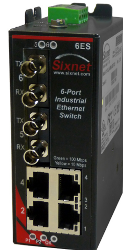
SLX-6ES-4/5 Aluminum Case Wide Temperature

We have been designing industrial hardware such as Remote Terminal Units for over 30+ years and have used this expertise to design the toughest Ethernet switches on the market. Don't trust your critical communications to so-called industrial hardware from commercial switch manufacturers. Sixnet switches give you proven assurance that your system will keep running for years to come.